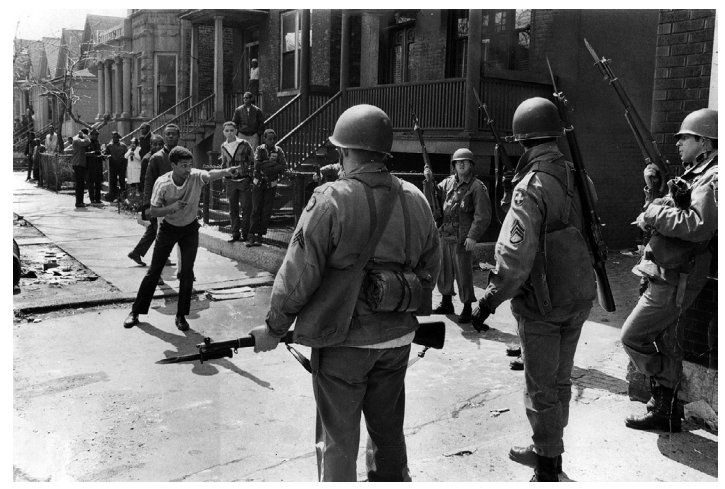
Chicago Riots of 1968.