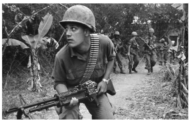
The Vietnam War