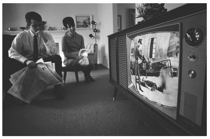
A couple watching footage of the Vietnam War on their television, February, 1968.

The relationship of the free press to the military operations and government agencies that oversaw them throughout the Vietnam War was a dynamic one that ebbed and flowed throughout the conflict. Due to concerns about national security, President Eisenhower attempted to control the flow of information by establishing thirty additional levels of information classification in 1953, effectively restricting public access to a great deal more information than had previous administrations and laying the groundwork for how the news media would interact with government officials throughout the Vietnam War that would begin two years later. While there were of course legitimate security reasons for this action, new restrictions also served to help the administration cover up information it did not want in the hands of the press media or public. When President Kennedy—himself a former journalist took office, he had a much greater command over the state of journalism and television in the United States, and he