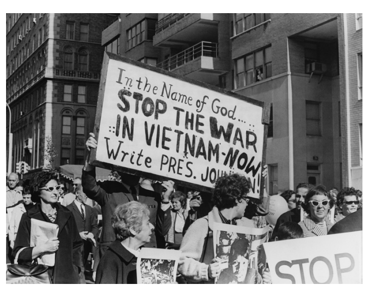
Vietnam War protests