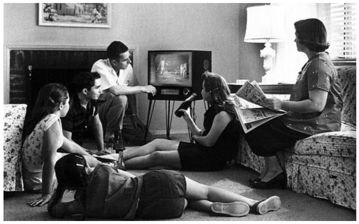
A family watches the moon landing on TV on July 20, 1969

Of the roughly 8-day mission, however, only the moon landing and the subsequent "splashdown" into the Pacific Ocean