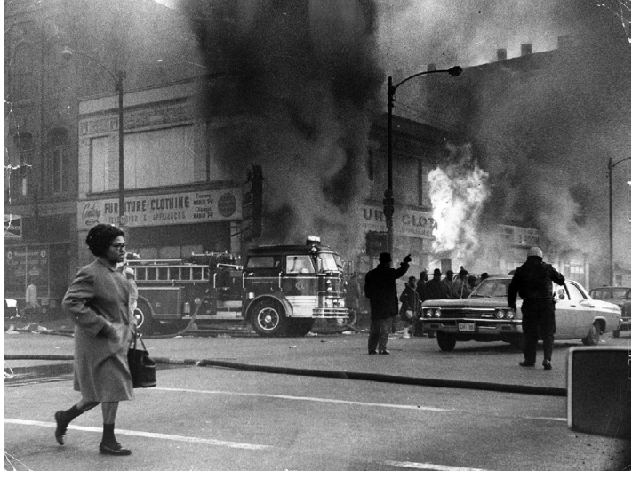
Chicago Riots of 1968.

When Dr. Martin Luther King, Jr. was assassinated on April 4, 1968, communities across the country grieved and were thrown into crisis by the news. Riots erupted in many cities, but no other city in the country was helmed by Chicago's Mayor Daley and his political machine. Richard J. Daley was elected in 1955 and lorded unyielding power over the city of Chicago until his death in December of 1976. Daley was—and still to this day is—infamous for his extreme tactics of voter influence and coercion, particularly in the severely segregated city's black neighborhoods, to maintain his position, and he was known to appoint loyalists to his administration and ensure their longevity through corruption, public manipulation, and careful gerrymandering of voting districts. He was a staunch segregationist and did everything he could to maintain the established racial barriers between neighborhoods; he knew that if the black population were to disperse and be represented in voting blocs throughout the city (as would happen under a city-wide policy of integration), he would be ousted at the next election. Throughout the mid- and late-60s, Chicago's civil rights activists had utilized tactics both of nonviolence and of armed resistance in their fight to integrate the city under Daley, but he had corrupted the city's political leadership so thoroughly that they had little success in effecting lasting change and, in fact, were overwhelmingly met with police violence and brutality